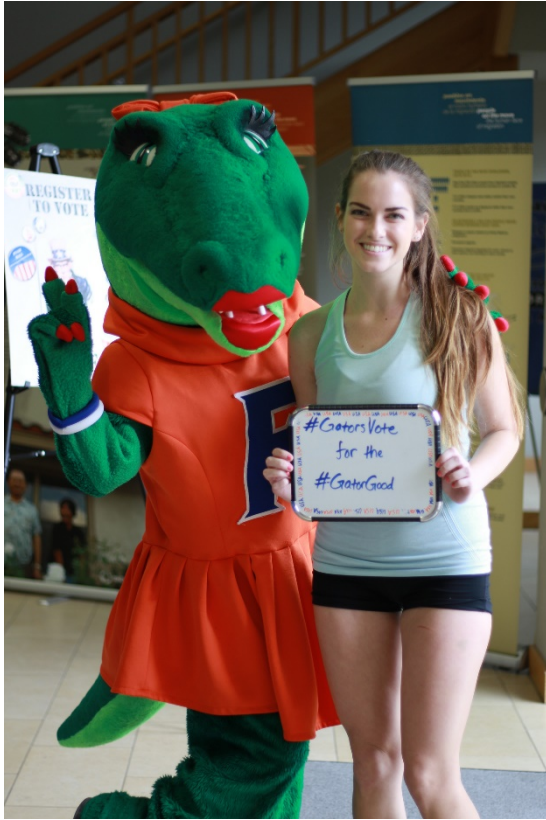
Voter Registration drive and meet and greet with Alberta Gator in Pugh Hall