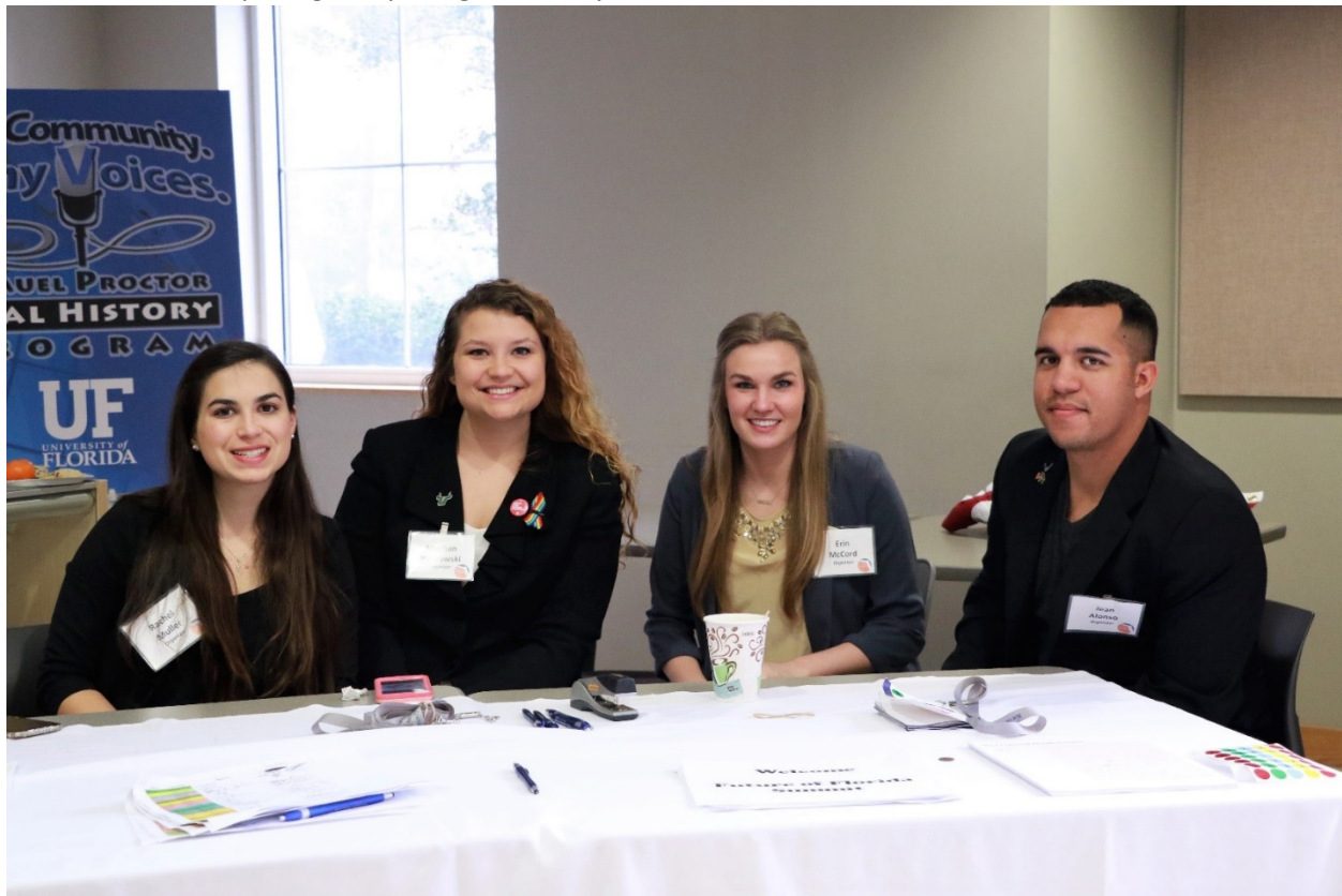
Members of the Future of Florida Summit student organizing committee

Our student-run Future of Florida Summit calls upon the most engaged student leaders from public and private universities across the state to immerse themselves in a key challenge facing Florida and propose policy solutions. Along the way students learn everything from how to capture the attention of busy lawmakers to composing compelling testimony.