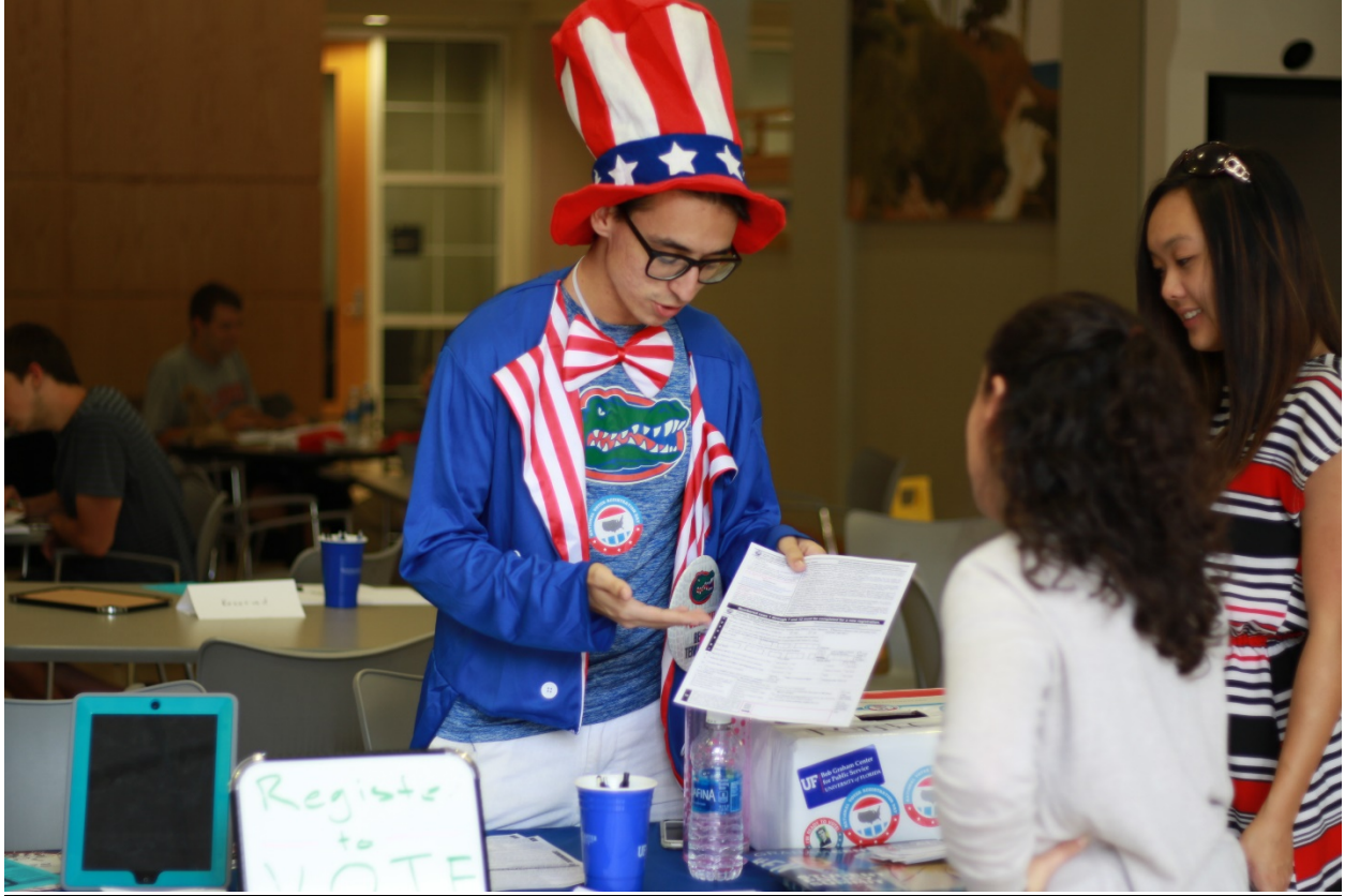
National Voter Registration Day pizza party in Pugh Hall