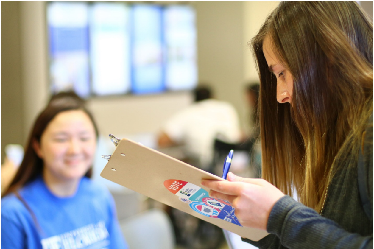
Voter registration drive in Pugh Hall